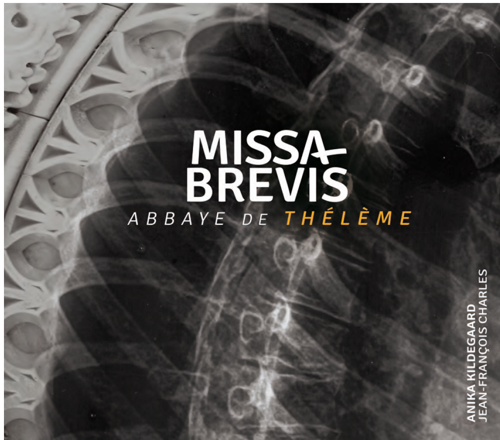
Figure 1. Missa brevis Abbaye de Thélème album art

Abbaye : the album sonifies the gargantuan, utopian abbey described by the ex-Franciscan friar François Rabelais in the first book of Gargantua and Pantagruel (ca. 1532), a kind of Grail-quest parody featuring two giants (Probst-Biraben 2020). The album art features stone tracery from the abbey interlaced with X-ray ribs arching down to a spine, playing off the ancient tradition of the temple as a giant cosmic man (Figure 1; see Lawlor 1982, 90–93).